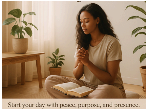
Start your day with peace, purpose, and presence.

This is a flexible blueprint. Some days you may spend more time in one step than another. The goal is not perfection, but presence. This routine helps me walk in God's peace and joy, and I know it can do the same for you.